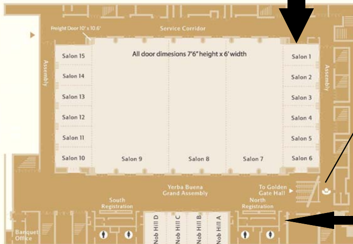
Yerba Buena Ballroom Lower B2 Level